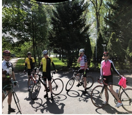
Kent Island Metric Century,