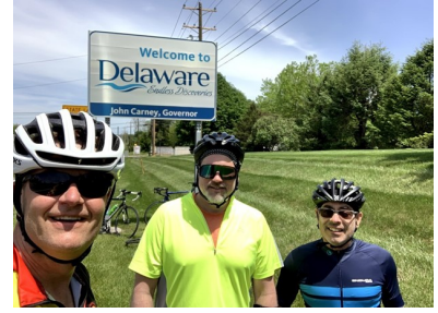
Delaware Canal Century