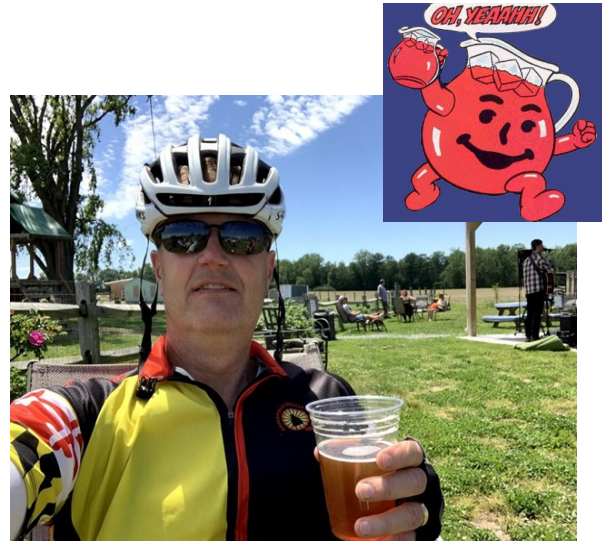
Our Club President with a beer! Wild man!

Submit your own pictures and stories to the Tailwind Editors: