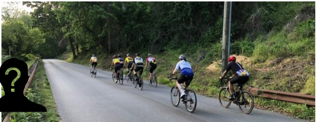
Wednesday night ride in Patapsco State Park. Who can identify the butts?