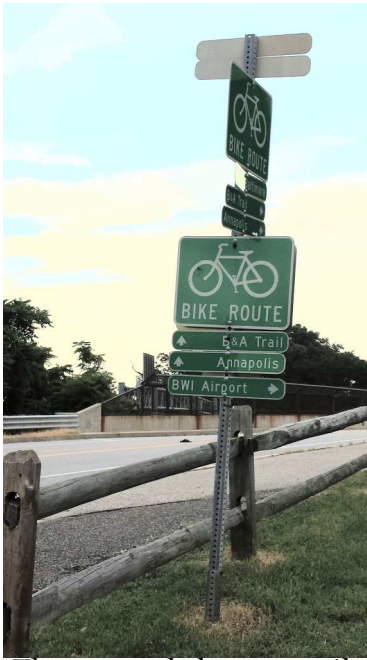
The 56 and the 100 mile route rejoined at the intersection of the BWI Airport loop and the B & A trail.