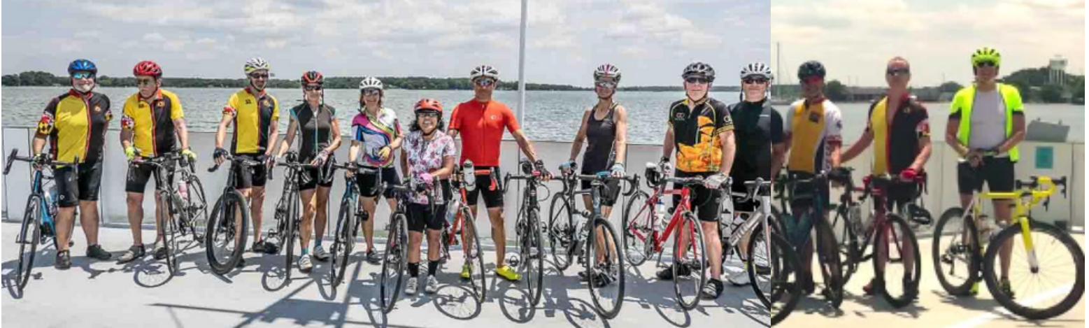
Weekday St. Michaels ride 6/13/23 at the Oxford-Bellevue Ferry