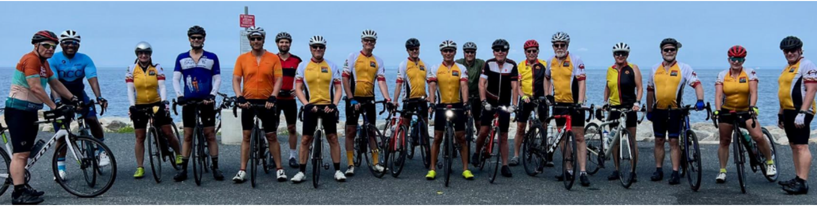
SATURDAY AT ST. MICHAELS