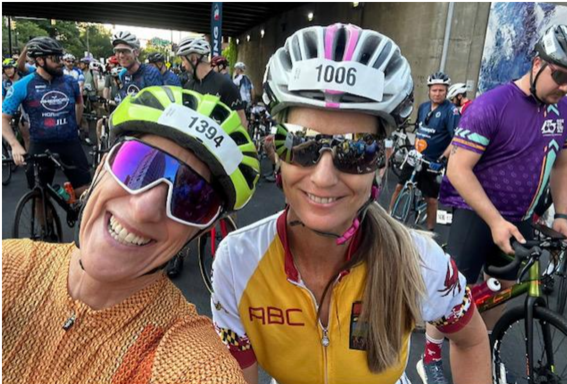
ABCers at the Armed Forces Classic Criterion