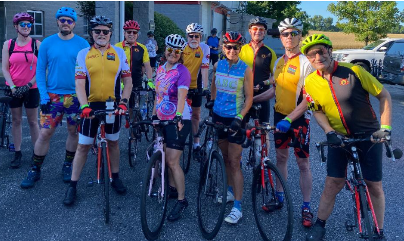
About to get underway with the Bay-to-Bay Ride 6/25/23