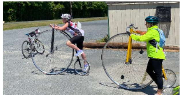
Above: You never know what you might spot at the 6 Pillars Century Ride (5/6/2023). Penny Farthing, anyone?