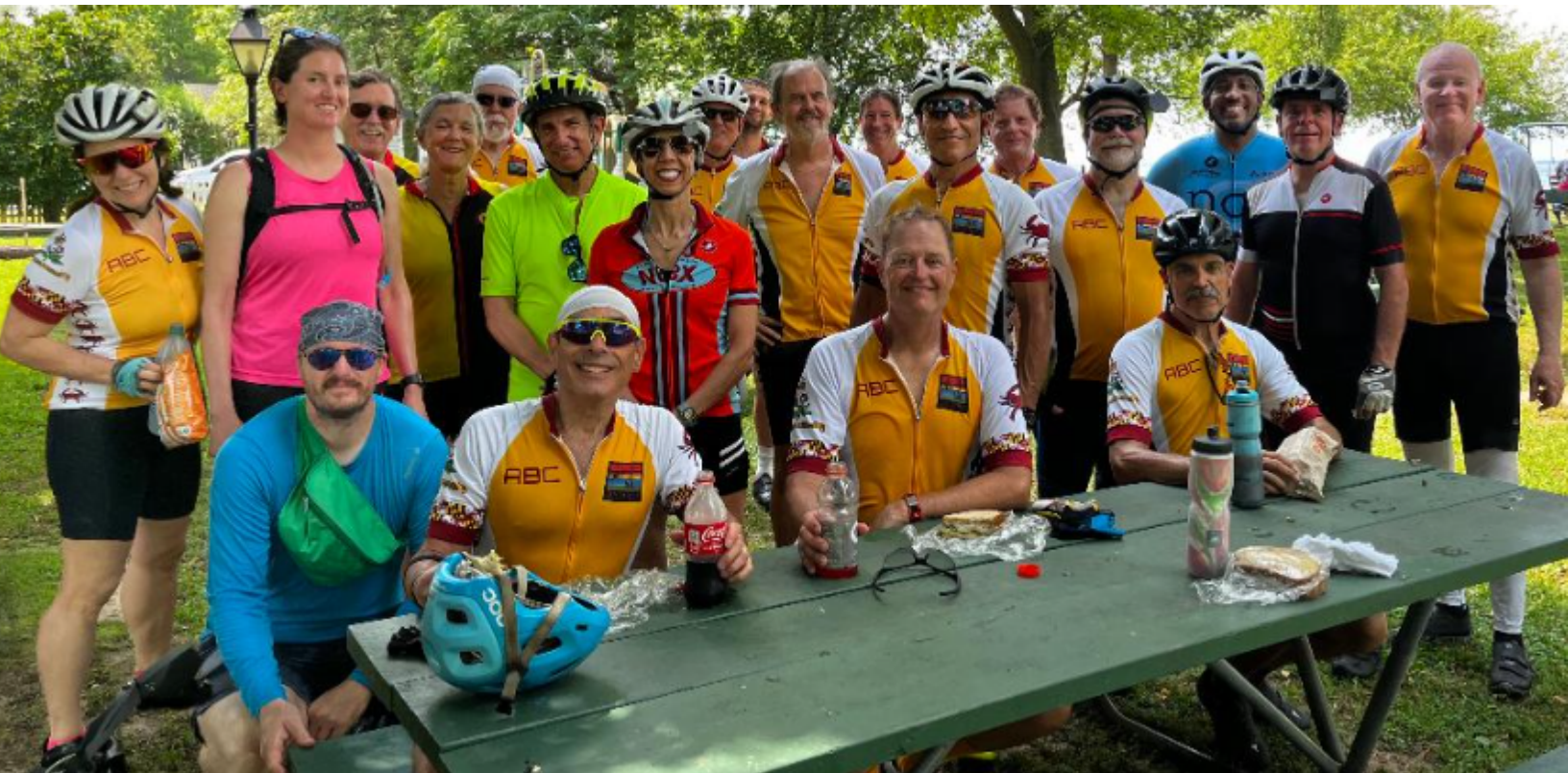
After lunch at Bellevue Park on the Saturday St. Michaels ride