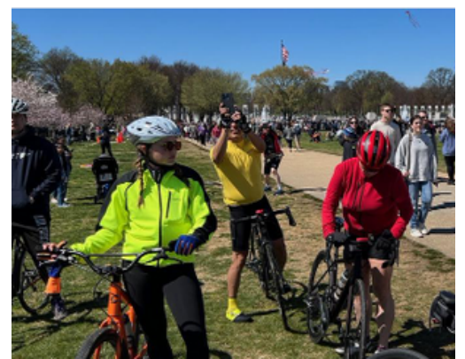
Cherry Blossom Ride 3/26/23