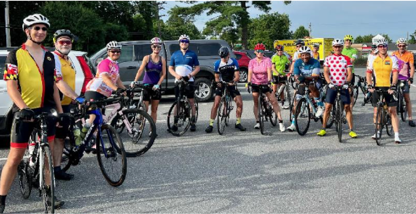
About to launch a Saturday morning N. Beach ride out of South HS July 2023

Below: Some Moving Pictures... Click to see short videos